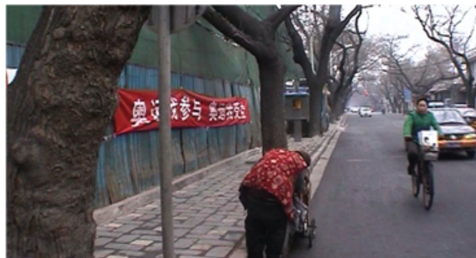
Leung Mee Ping, Out of place - Beijing , 2008. Single channel DVD, 00:08:04. Courtesy of the artist.