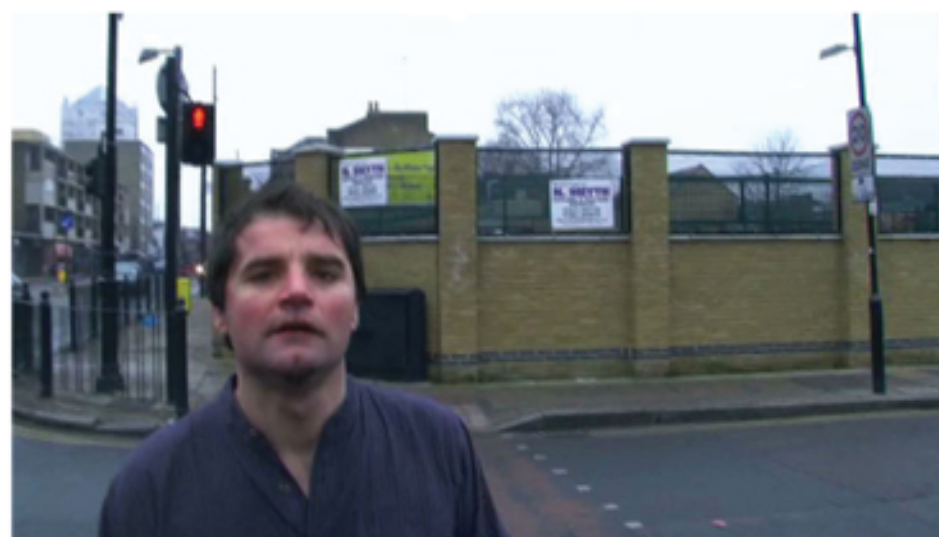
James Parkin, Backwards Forwards , 2009. Single channel DVD, 00:10:00. Courtesy of the artist.