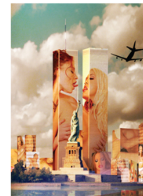
Edouard Saller, Flesh , 2005. Single channel DVD, 00:09:50.