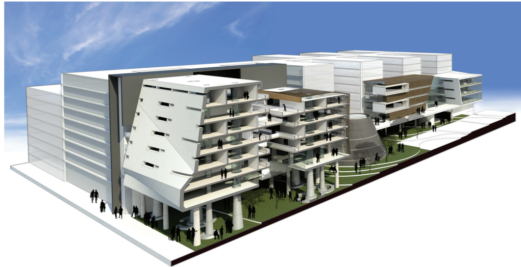
Brooke Madill desert pavements.....heterozygous infrastructure 2010 Graduate Diploma of Landscape Architecture

The project involves the design of an Australian embassy within the context of Pretoria, South Africa. The program of the embassy includes the provision of three building functions: residential, chancellery and common public realms.